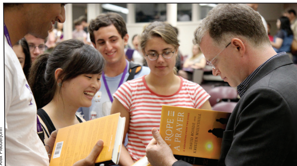
David Rohde, a 1984 Institute student who was kidnapped by the Taliban while reporting for The New York Times in 2008, signs copies of his book "A Rope and a Prayer" for Institute students after a lecture.

Admission is competitive; decisions are based on ability and merit.